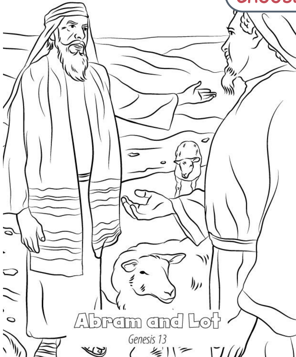
Abram and Lot