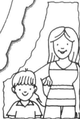
brother or sister