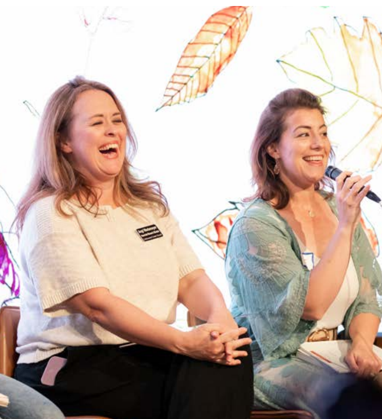
Table Talk with Creek Women is meant to foster relationships with other like-minded women while growing in our Christian faith. We will study the word of God and learn how to apply it to our lives through guest speakers and small group table discussions. Bring your own lunch or buy one through the church.

Third Thursday of Every Month 12 - 1 p.m. | B111